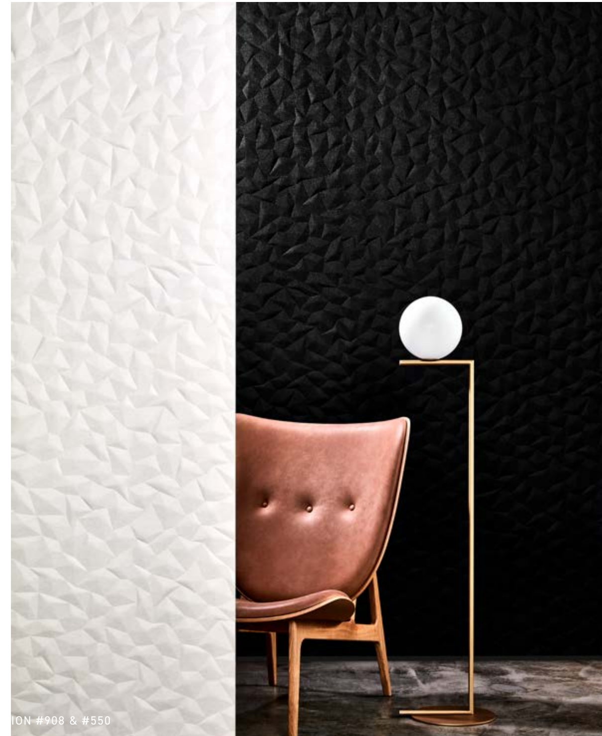
ION #908 & #550

Ion is the second design in this beautifully tactile, three-dimensional, floor-to-ceiling panel range that takes acoustic wall finishes to the next level of design. Ion panels have been designed to pattern match in both continuous wall and double-height installations.