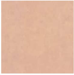
TERRACOTTA SUN BLEACHED